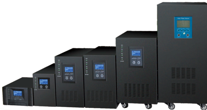
技术参数 Products Specification :